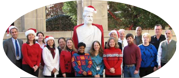
Happy Holidays from the entire Virginia TBI Model System Team!